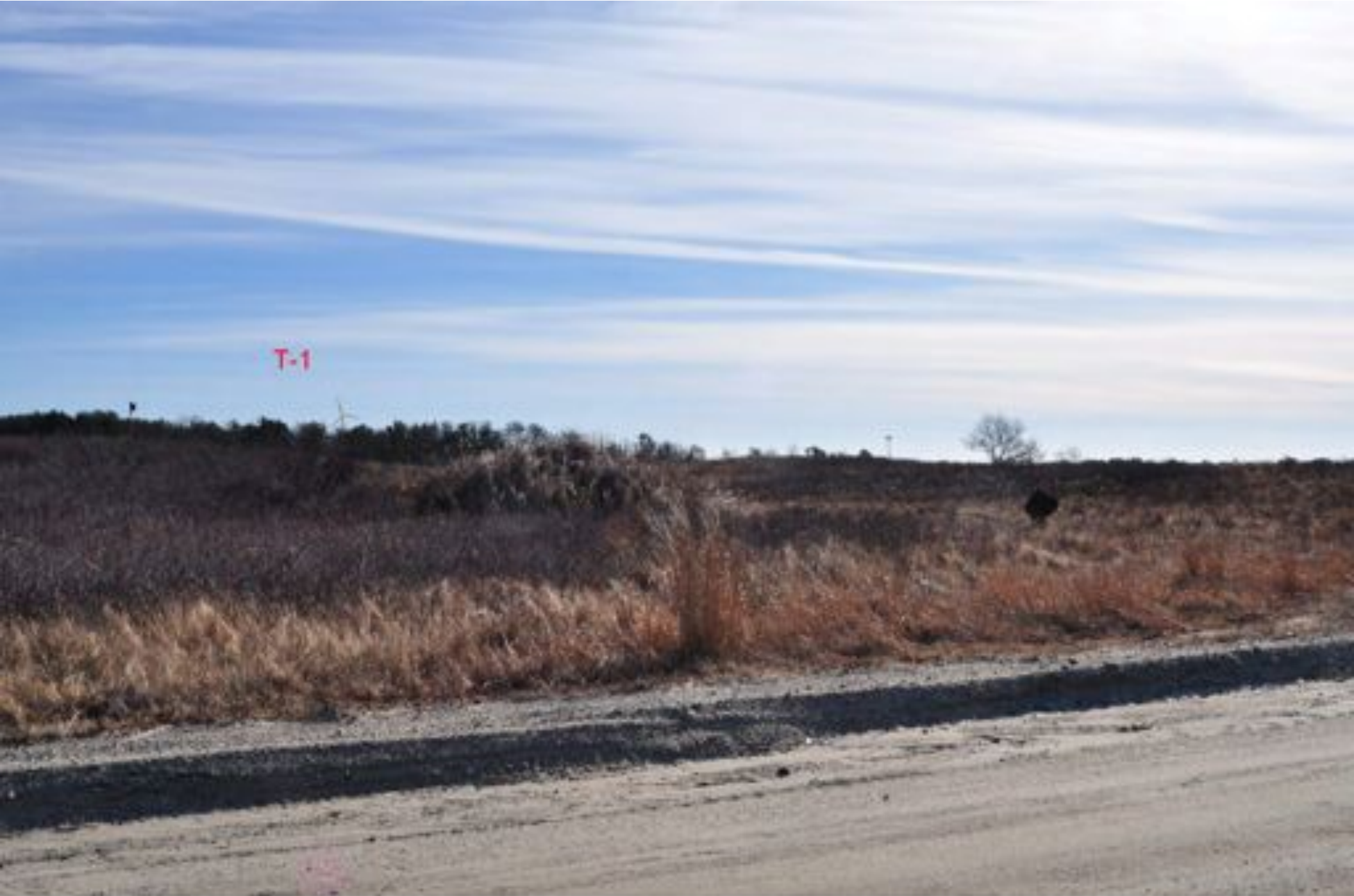
MADAKET WIND TURBINE PROJECT PROPOSED CONDITIONS WITH ONE 71M TOWER LOCATION 'A' - VIEWING FROM IN FRONT OF 109 EEL POINT ROAD (LOOKING SOUTH)