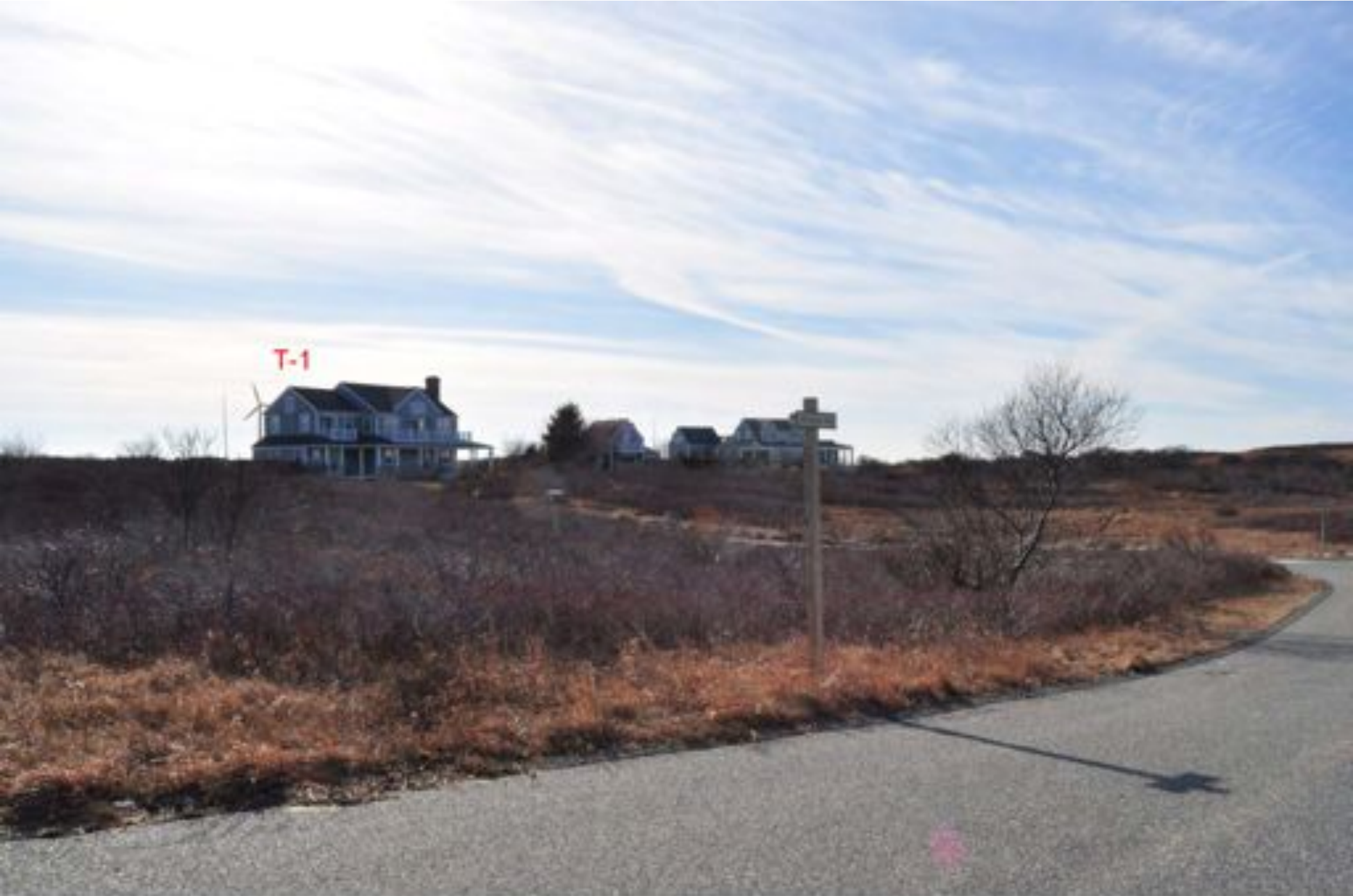
MADAKET WIND TURBINE PROJECT PROPOSED CONDITIONS WITH ONE 71M TOWER LOCATION 'B' - OVERLOOKING 1 BRAEBURN WAY AND 30 DOUGLAS WAY (LOOKING SOUTHWEST)