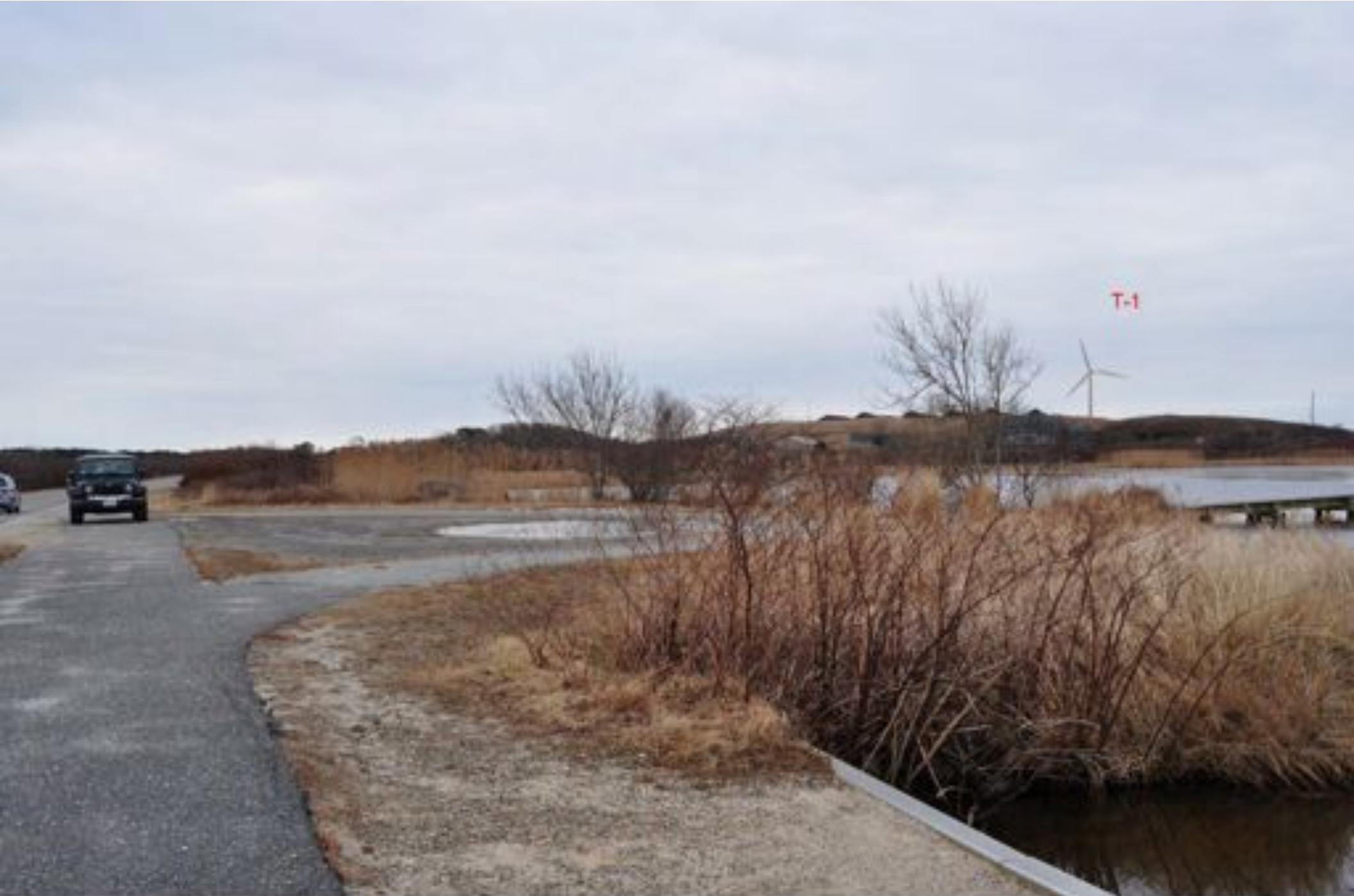
MADAKET WIND TURBINE PROJECT PROPOSED CONDITIONS WITH ONE 71M TOWER LOCATION 'V' - BIRD VIEWING AREA (OVERLOOKING LONG POND)