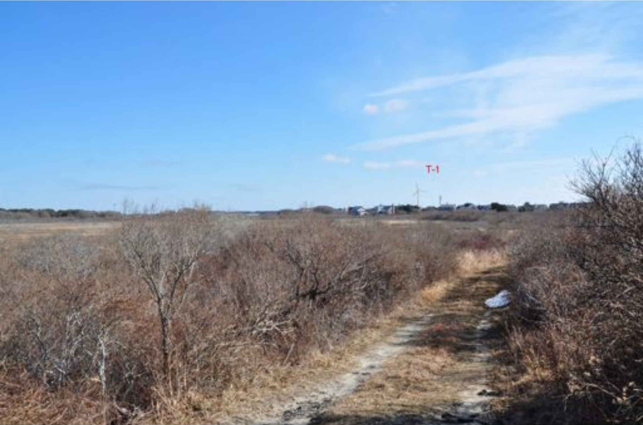
MADAKET WIND TURBINE PROJECT PROPOSED CONDITIONS WITH ONE 71M TOWER LOCATION 'Q' - OFF NORTH CAMBRIDGE STREET (LOOKING EAST)