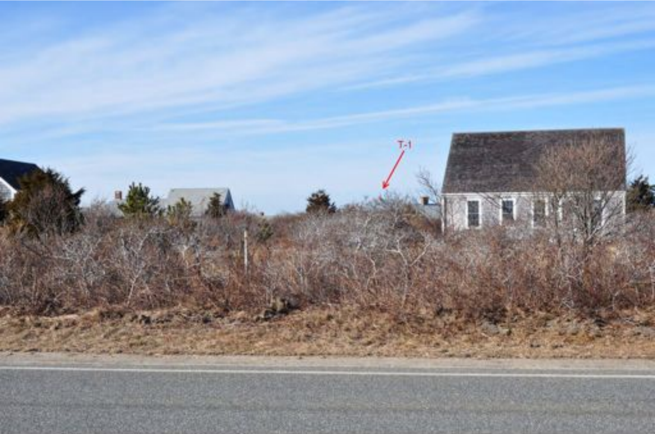
MADAKET WIND TURBINE PROJECT PROPOSED CONDITIONS WITH ONE 71M TOWER LOCATION 'G' - OVERLOOKING 239 HUMMOCK POND ROAD (LOOKING NORTHWEST)