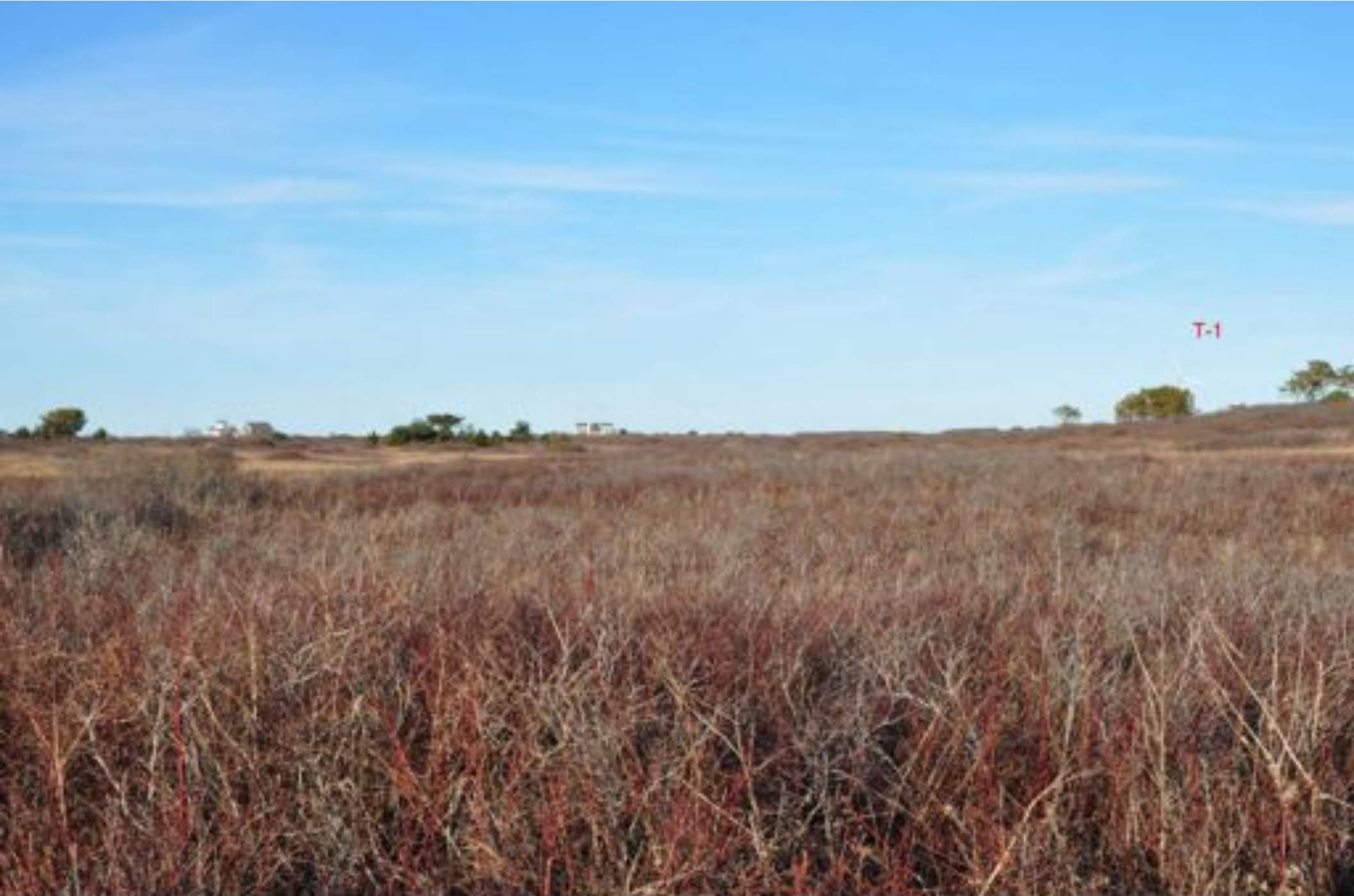
MADAKET WIND TURBINE PROJECT PROPOSED CONDITIONS WITH ONE 71M TOWER LOCATION 'L' - INTERSECTION OF SHEEP POND ROAD AND RED BARN ROAD (LOOKING NORTHEAST)