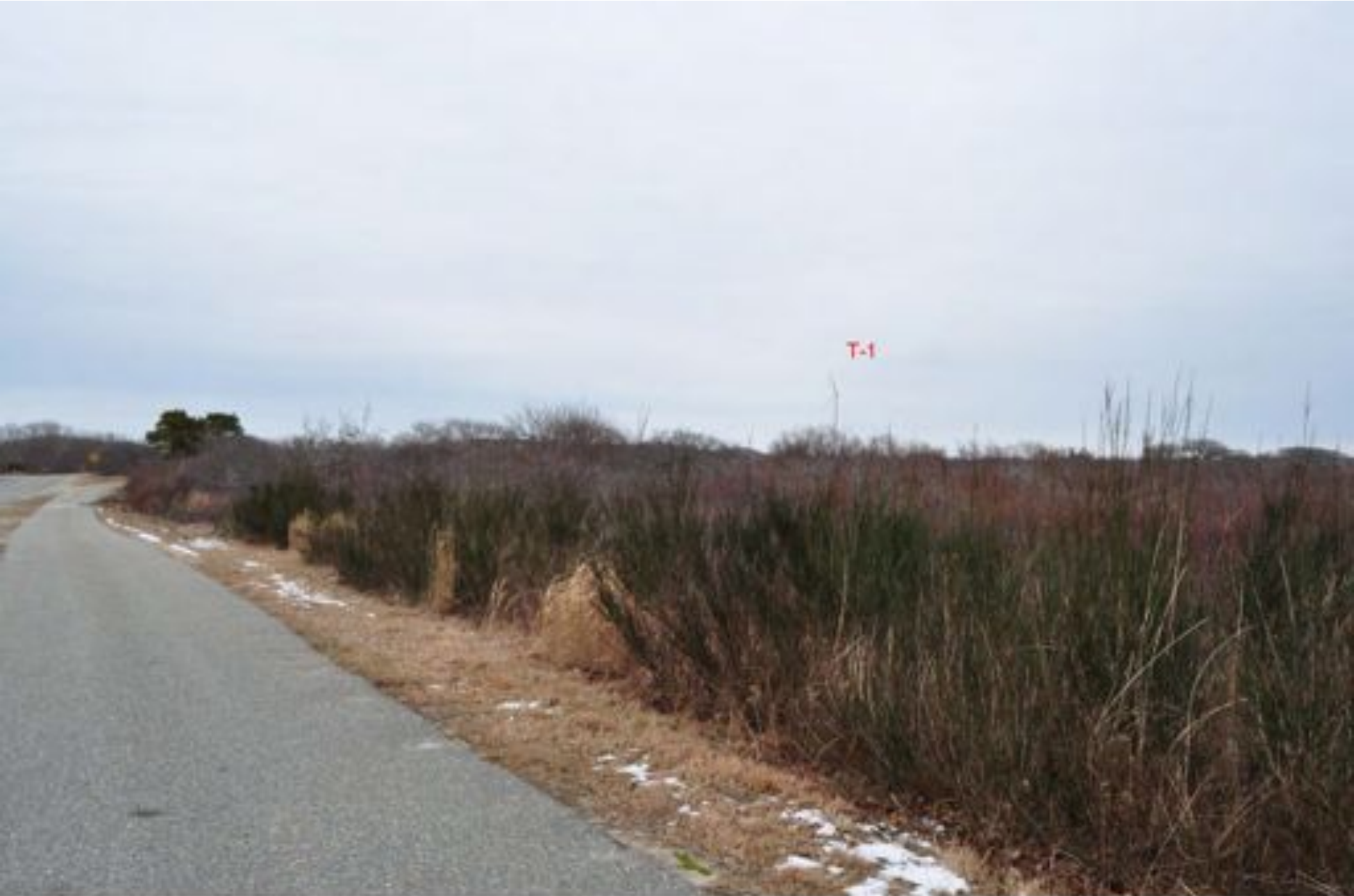
MADAKET WIND TURBINE PROJECT PROPOSED CONDITIONS WITH ONE 71M TOWER LOCATION 'P' - TAKEN IN FRONT OF 199 MADAKET ROAD (LOOKING EAST)