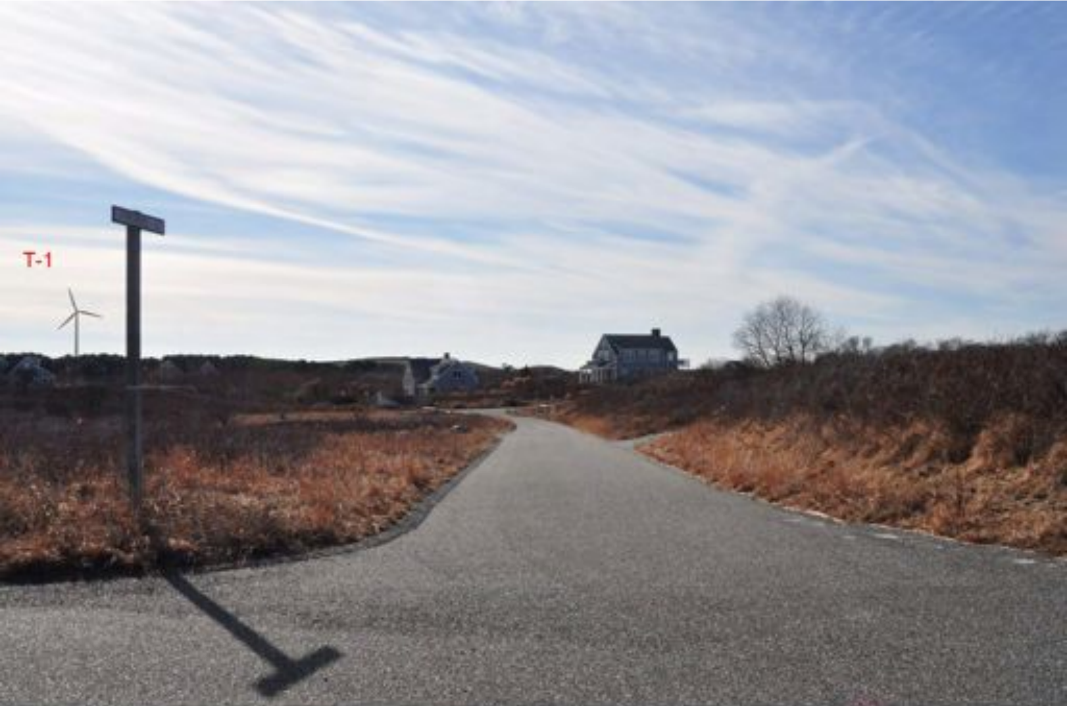
MADAKET WIND TURBINE PROJECT PROPOSED CONDITIONS WITH ONE 71M TOWER LOCATION 'C' - OVERLOOKING 3 & 4 FINTRY LANE (LOOKING SOUTHWEST)