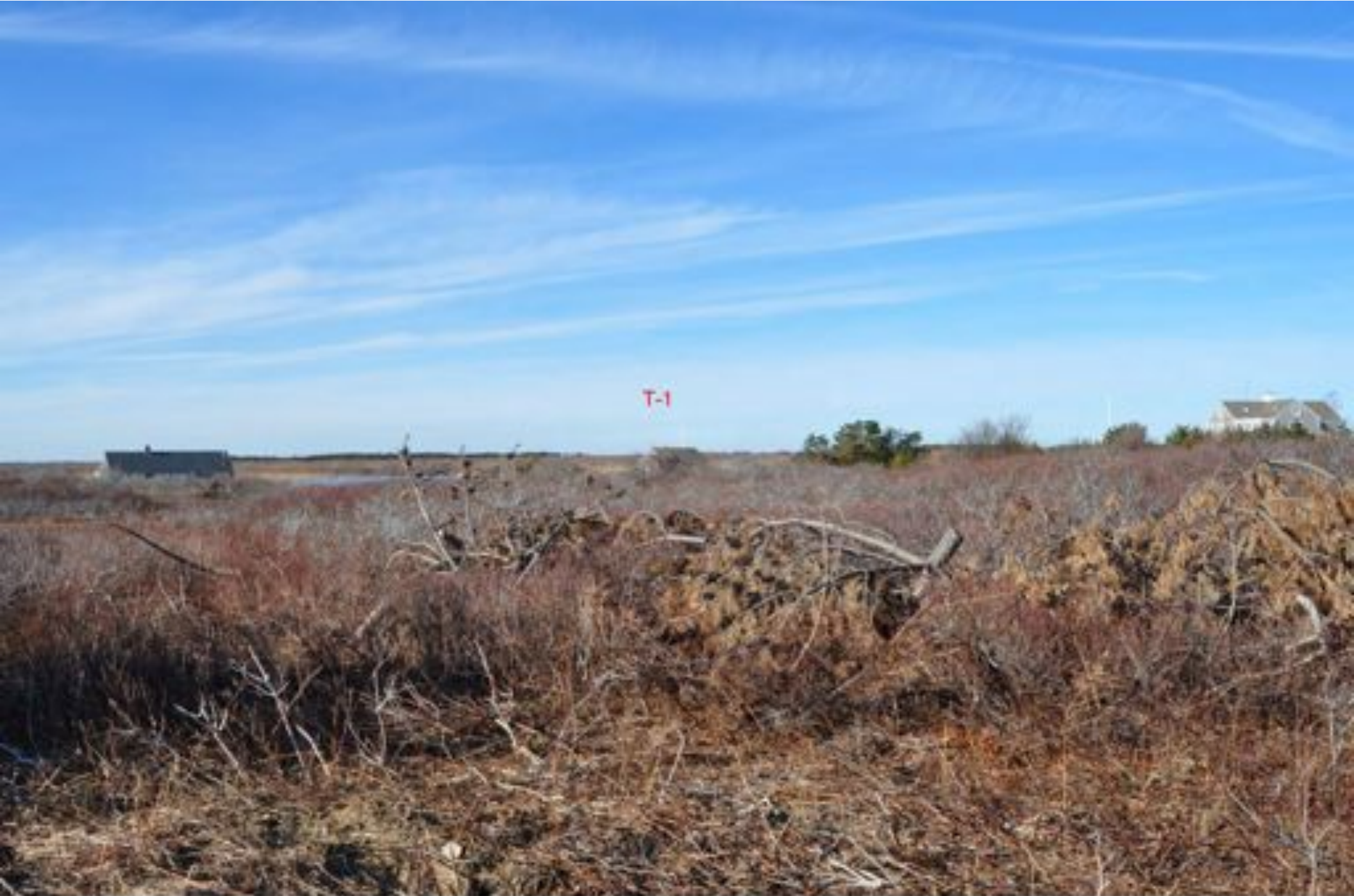
MADAKET WIND TURBINE PROJECT PROPOSED CONDITIONS WITH ONE 71M TOWER LOCATION 'H' - OVERLOOKING 27 OSPREY WAY (LOOKING NORTHWEST)