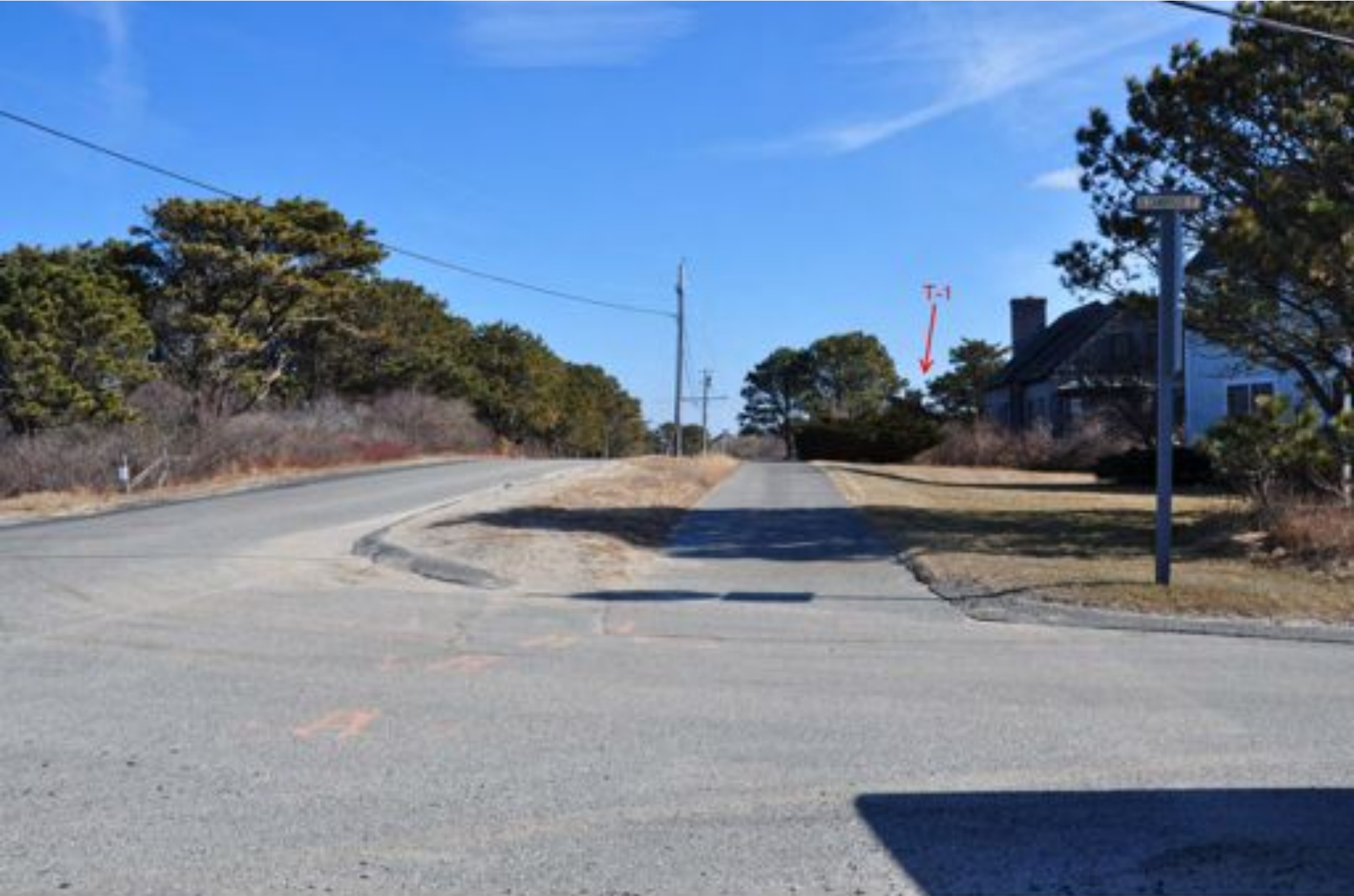
MADAKET WIND TURBINE PROJECT PROPOSED CONDITIONS WITH ONE 71M TOWER LOCATION 'O' - INTERSECTION OF MADAKET ROAD & S. CAMBRIDGE STREET (LOOKING EAST)