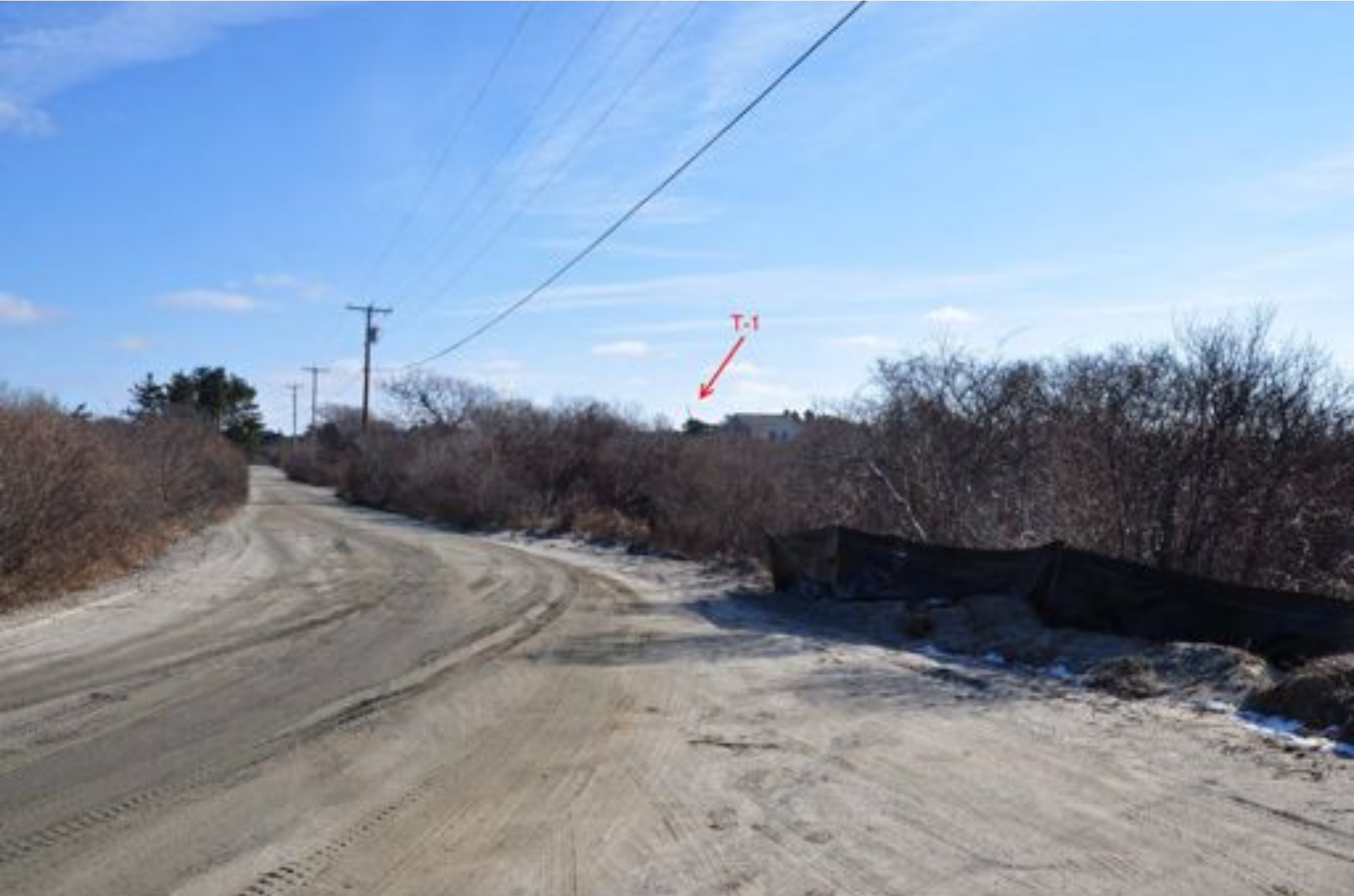
MADAKET WIND TURBINE PROJECT PROPOSED CONDITIONS WITH ONE 71M TOWER LOCATION 'R' - IN FRONT OF 51 WARREN'S LANDING ROAD (LOOKING SOUTHEAST)